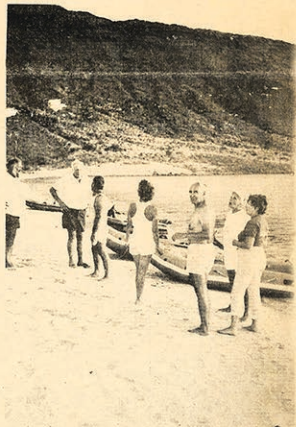
The "Cruisers" have a beach all to themselves. Everybody's favorite meats were brought to be cooked on the pit.