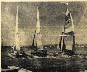
The Catamaran races saw some heavy competition. The fast "Cats" had to maneuver around a heavily congested course and back to the starting point in order to win.