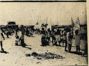
EVERYONE HAD A good time either watching or participating in the Dinghy Regatta put on by the Club Cruceiros de La Paz.

Want To Live Legally In México? We Can Help You Comply With Mexican Law.