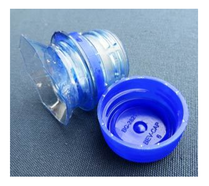
Step 3: Cut off the bottle top...

Cut off just a little bit of the bottle top. I used a steak knife – this water bottle was thick! Don't worry about making it too even. I think a little lopsided might make it "swim" better. Keep the cap. You'll need it.