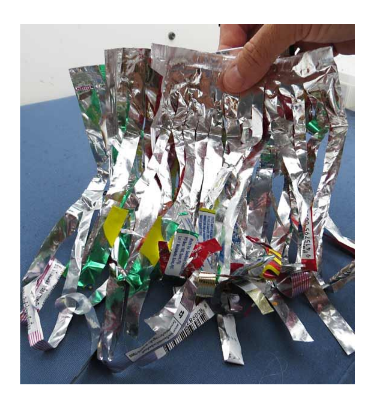
Step 7: Roll the hula skirts...