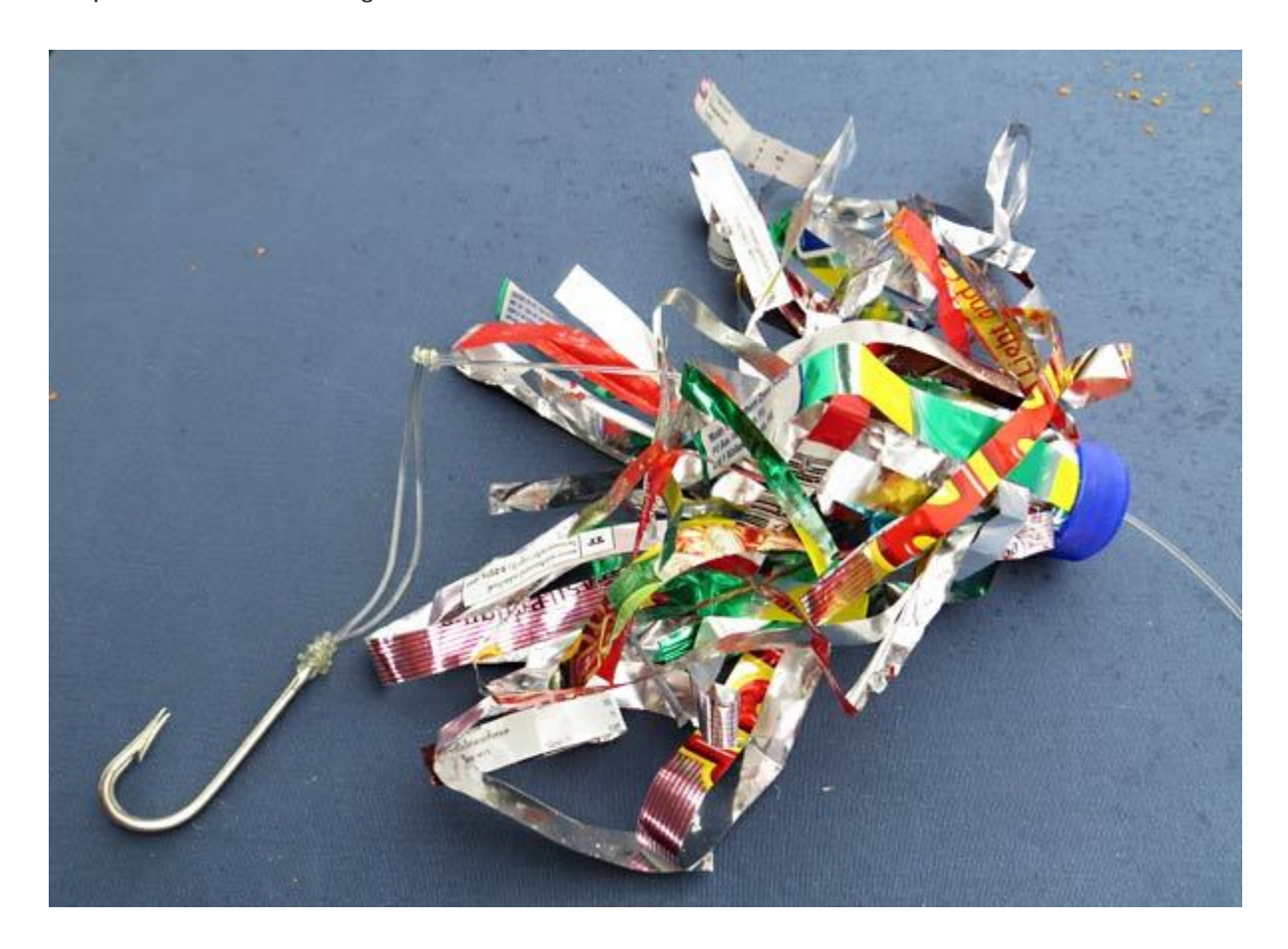
Step 10: Do all that angler stuff with the line and hook...

Stick your leader through the hole you drilled in the bottle cap, tie on the hook and you're done. Just a note: I used a stopper knot to keep the hook positioned back by the trailing end of the streamers. You could use a crimp or beads (or maybe something else from a junk food package – get creative).