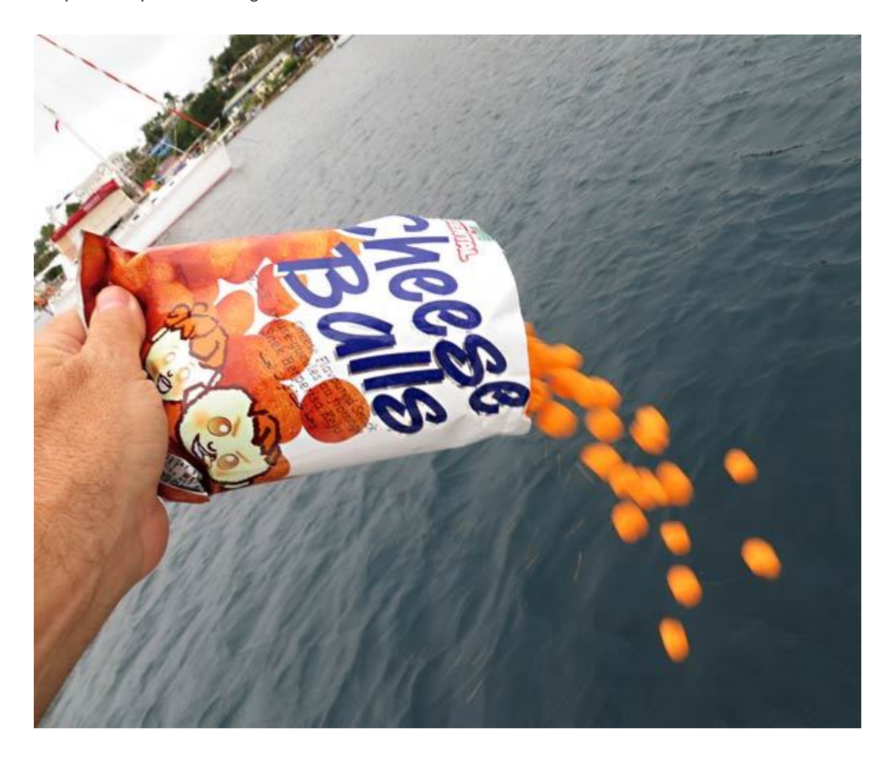
Step 2: Prepare the bags...

Eat the stuff if you don't mind a nice orange glow to your skin or dying a few days earlier. If that stuff bothers you, feed it to the fish. (Not the fish you'll be catching. After all, you'll be eating them in a few hours!)