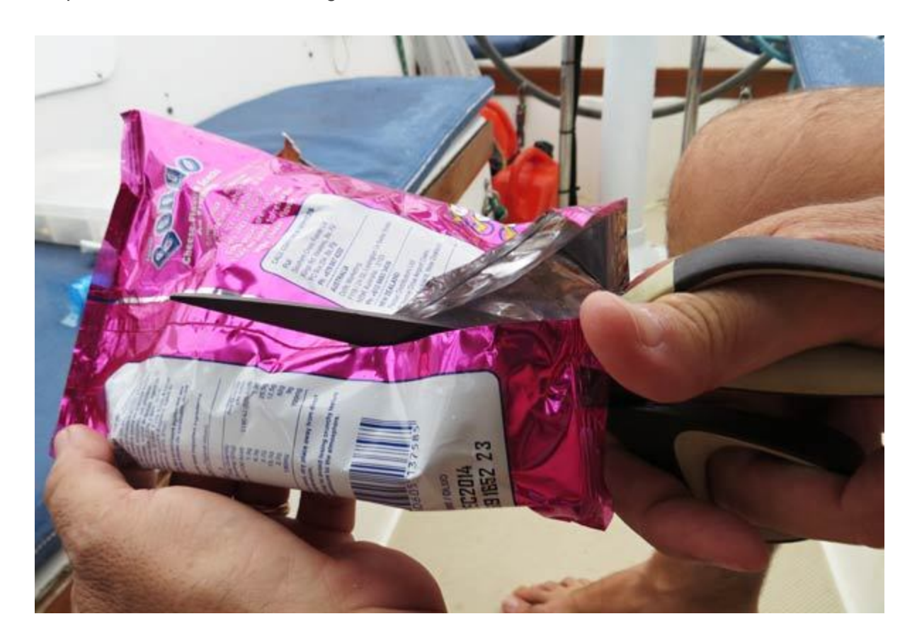
Step 5: Cut and flatten the bags...

Open the bottom and top of the bag, then cut up the side, just to one side or the other of the seam so that you have a flat sheet of very messy junk food bag.