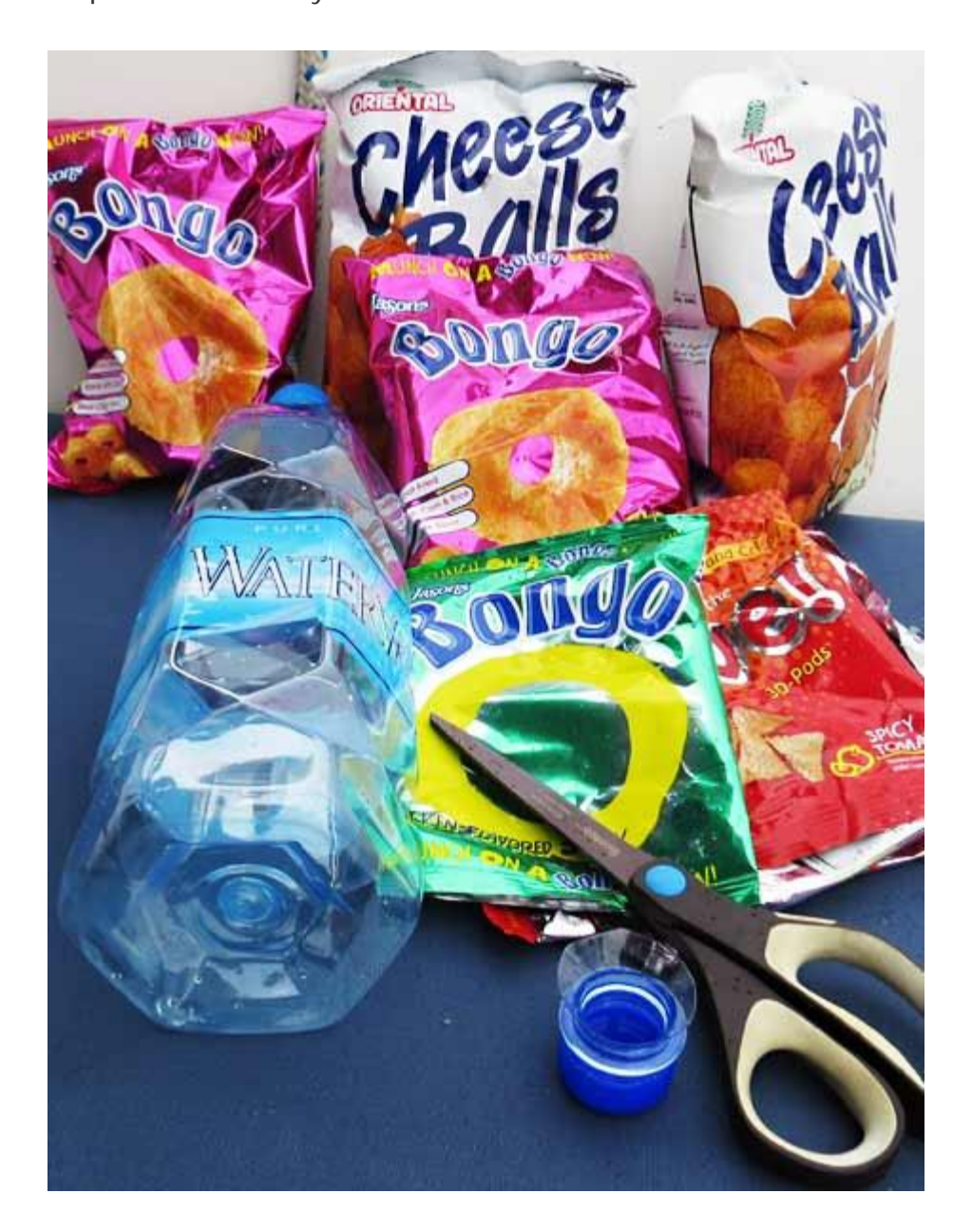
Step 1: Here's what you'll need...

Junk food bags. Pick the colors you think the fish you like to eat would like to eat. I used three per lure.