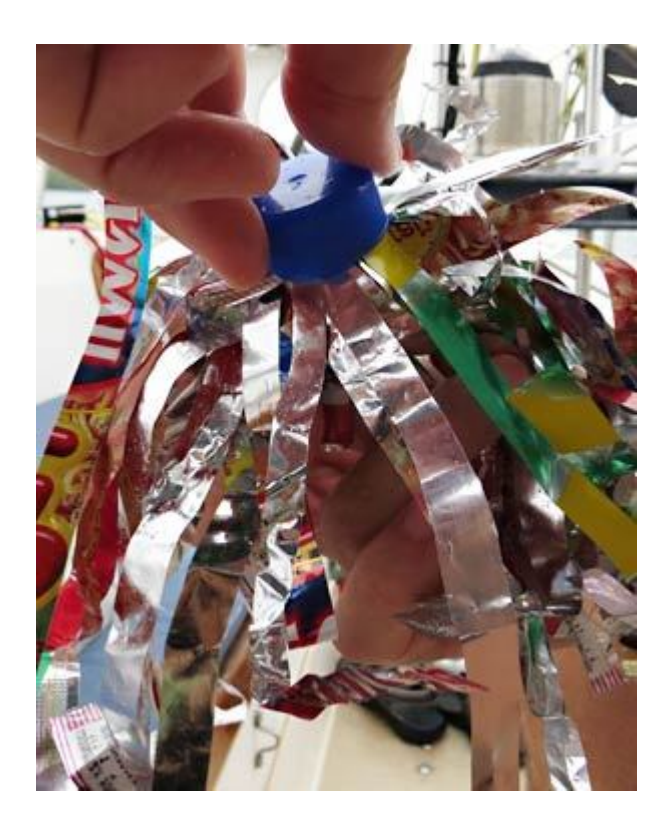
Step 9: Fold and screw...

Fold the streamers back over the bottle top and screw on the cap. It's hard to get the bottle top started. You have to earn that mahi you're going to catch! I used pliers to tighten the cap.