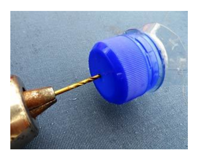
Step 4: Drill...

Drill a hole just big enough to get your leader through. Make the hole small enough that a stopper knot in the leader won't pull through the hole. Again, don't worry about the exact center. Drilling a little off center might also help it swim better.