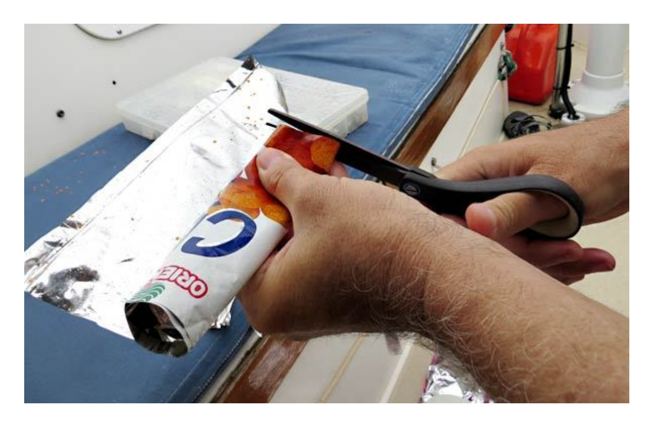
Step 6: Make hula skirts...